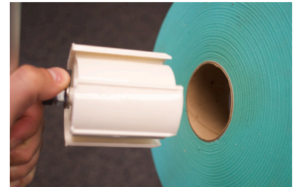
Place core of roll onto hub

NOTE: Saint-Gobain Performance Plastics Corporation does not assume any responsibility or liability for any advice furnished by it, or for the performance or results of any installation or use of the product(s) or of any final product into which the product(s) may be incorporated by the purchaser and/or user. The purchaser and/or user should perform its own tests to determine the suitability and fitness of the product(s) for the particular purpose desired in any given situation.